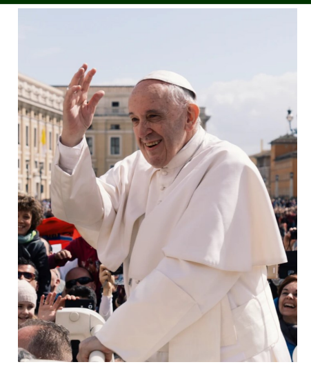
POPE FRANCIS' PRAYER INTENTION FOR JULY